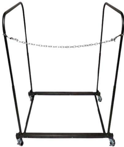
Caster Kit - Model #TMD4870CS-KIT