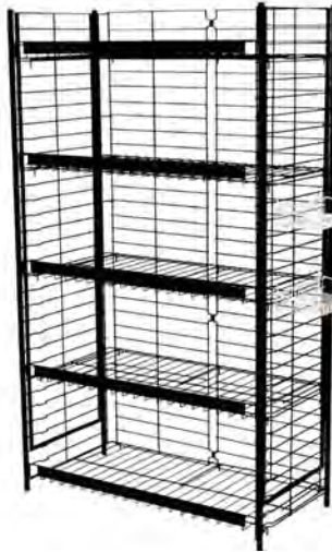
64" tall x 36" wide, 5 Shelves Model #PR64-36-5