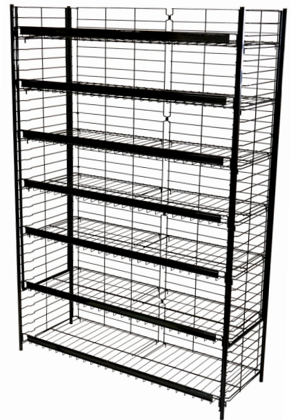
72" tall x 48" wide, 7 Shelves Model #PR72-48-7S