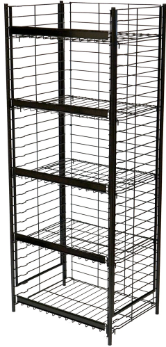
64" tall x 24" wide, 5 Shelves Model #PR64-24-5S