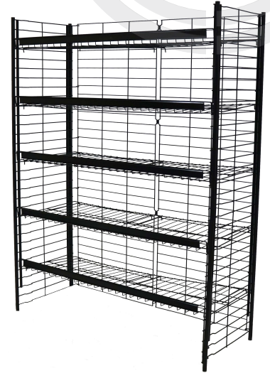
64" tall x 48" wide, 5 Shelves Model #PR64-48-5S