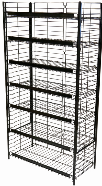
72" tall x 36" wide, 7 Shelves Model #PR72-36-7S

Optional casters (caster sets ordered separately)